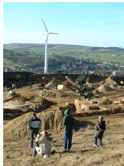
Naylor Hill Quarry, Brow Moor