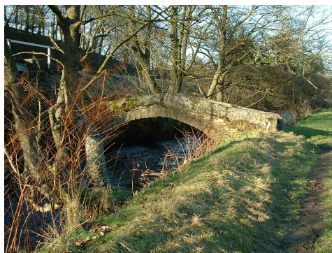
Donkey Bridge, Bridgehouse Valley