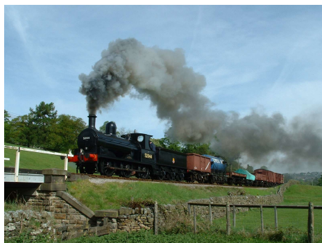
The Keighley and Worth Valley Railway Line

(Allow at least 6 hours to complete the 11 mile/17.5km walk).